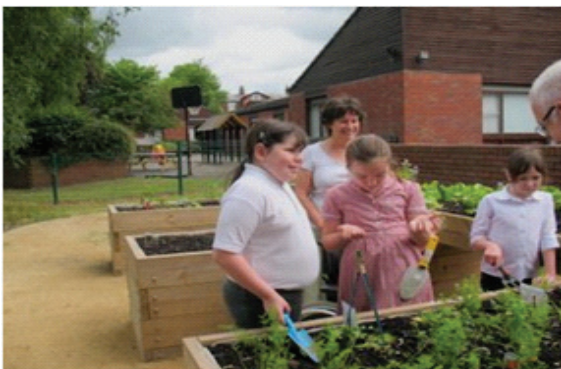
Raised beds at Hinderton, Springfields and Dorin Park Schools